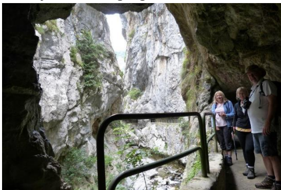
Walking the Cares gorge path