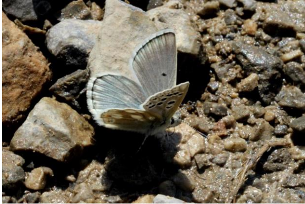
Gavarnie Blue male

past a small puddle, when Vicki, who was behind us, called out "what is this blue here then?" We turned around, and sure enough, there on the floor was a gorgeous male Gavarnie Blue drinking up salts.