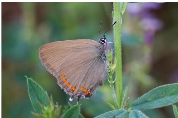
False Ilex Hairstreak

The meadow next to the villa also had good numbers of False Ilex Hairstreaks , and plenty of Blues, plus occasional Clouded and Berger's Clouded Yellows, Wood Whites, and just one Spotted Fritillary was seen.