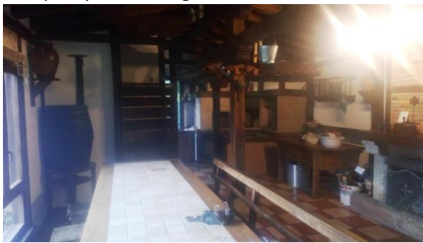
The BBQ lounge and BBQ