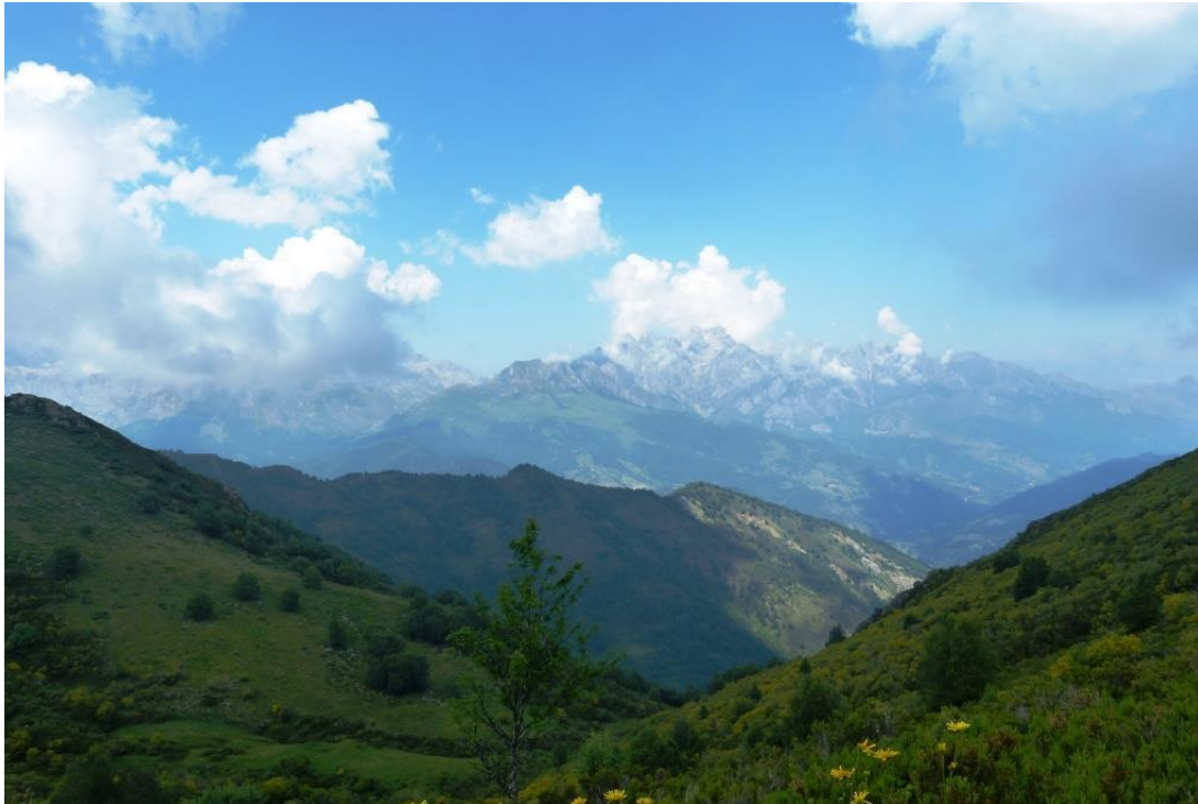
The Picos de Europa – view from the Collado de Lesba

Clear skies on the way back as we reached the high point near the Puerto enabled us to get the great views that we had missed when crossing in the clouds earlier in the week.