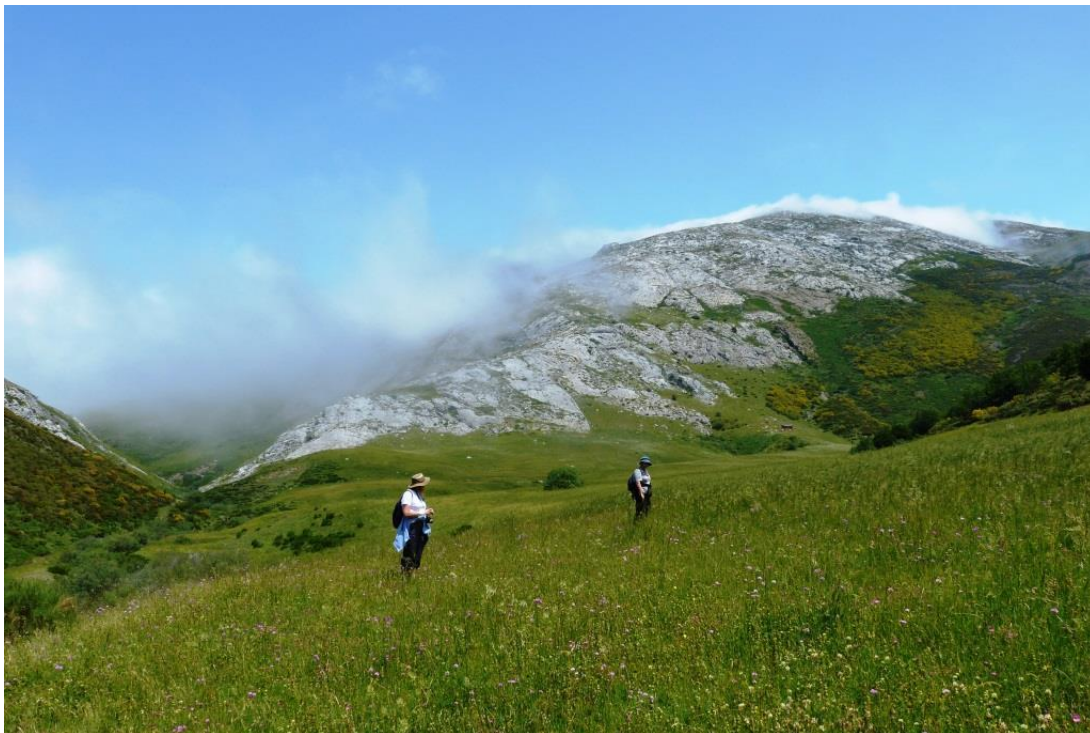
Butterflying in the alpine meadows

With the sun still shining, we moved on further and turned off a side road to head a little further north, stopping at a layby where two stray dogs were hanging around. They seemed friendly, if a little emaciated and neglected, and they kept us company as we explored a fabulous alpine meadow area, where a multitude of Blues, Coppers and Fritillaries were on the wing. Every now and then I found myself with a warm, damp nose poking into one or other of my shorts pockets.