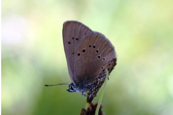
Dusky Large Blue