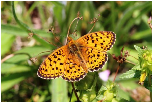
Lesser Marbled Fritillary

Bob and I did a quick trip to the supermarket to stock up on a few supplies, and I fell foul of the local bread police. There were a whole range of baguettes, round breads, long breads, all shapes and sizes, and all held in pull-out sliding drawers, but as I opened one to take out a loaf, a scary Spanish shop woman shouted “No!”, and physically stopped me from reaching for my bread. She gestured towards a glove dispenser. Apparently you have to wear gloves to pick up the bread (this doesn’t seem to apply to any of the fruit, vegetables or other products). So I donned the required glove, and was then given a strict lesson by Señora Scary on how to put the loaf into a paper and plastic bag, and weigh it on the scales, which would then produce a sticky label that was affixed to the bag. Duly chastised, we continued with the shopping.