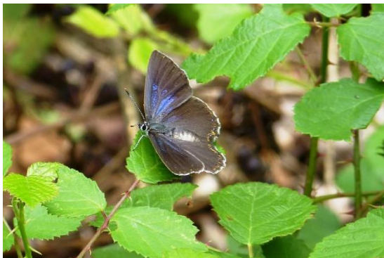
Spanish Purple Hairstreak

By mid-afternoon we were settled into the apartment, and were checking out the butterflies immediately surrounding our home base. It was pure luck that we had selected a villa that had a strong local population of Spanish Purple Hairstreak right on the doorstep! I had missed out on this species in Provence back in early June, due to the season out there running late, so it was a great pleasure to see these beauties up close. I had only ever seen one other Spanish Purple Hairstreak before, many years ago.