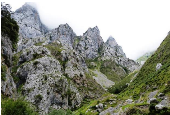
Part of the Cares gorge

We headed in a more northerly direction to the tiny settlement of Cain, at the start of the Cares gorge. Here, we turned into non-butterflying tourists and trekked along the stunning, and at times slightly scary, gorge walk. The scenery was highly dramatic and although it was busy with plenty of tourists, we really enjoyed our time walking along what is probably the most famous and most-visited walk in the area.