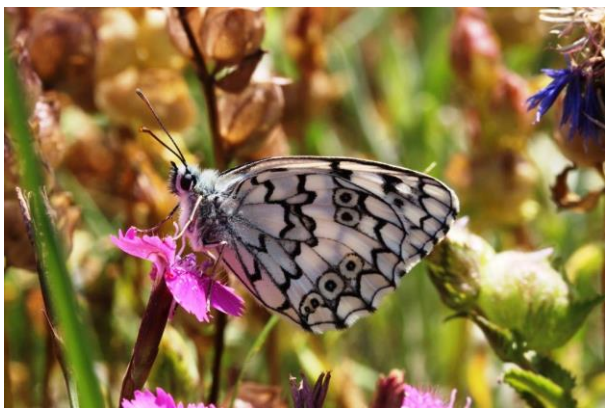
Esper's Marbled White

There were plenty of them at this lovely site, but I was also hoping to find Iberian Marbled White . It took a while, but finally I found a few in amongst the Esper's, and one eventually sat down and posed nicely. Another life-tick!