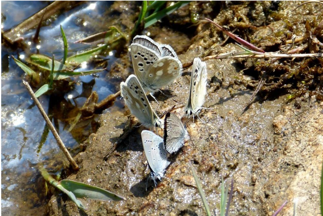
Gavarnie Blues and Small Blues mud-puddling

Further up near a large pond, we found more Gavarnie Blues, including some small groups of mud-puddlers.