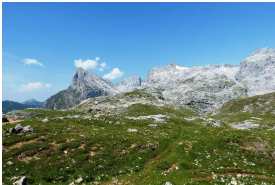
Habitat above Fuente De

Once again, this is a local form, f.astur , associated only with the Picos de Europa mountain range.