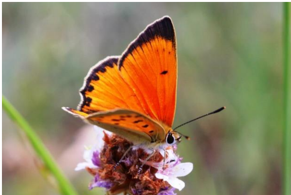
Scarce Copper subspecies miegii